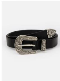
Western Style Buckle Belt For ... $2.48 -20%