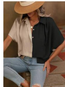
SHEIN LUNE Two Tone Batwing... $9.00 -21%